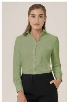
COTTON COMFORT FSH70